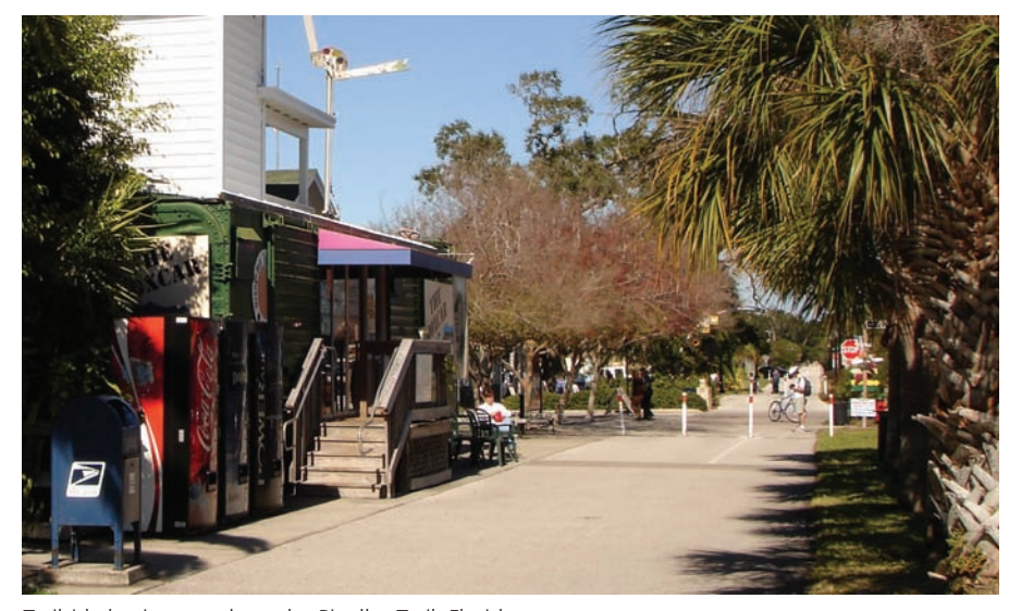
Trailside businesses along the Pinellas Trail, Florida.

Through careful planning, communities are realizing the full economic potential of linking trails and local businesses. In Cumberland, Md., for example, local businesses, in partnership with elected officials, have crafted a wellorganized Trail Town model that helps link bicycle tourists to downtown businesses. Cumberland Mayor Lee Fiedler points to the importance of this model for economic revitalization when he states that: "The revival of the city is driven, in part, by the trail. ... No one