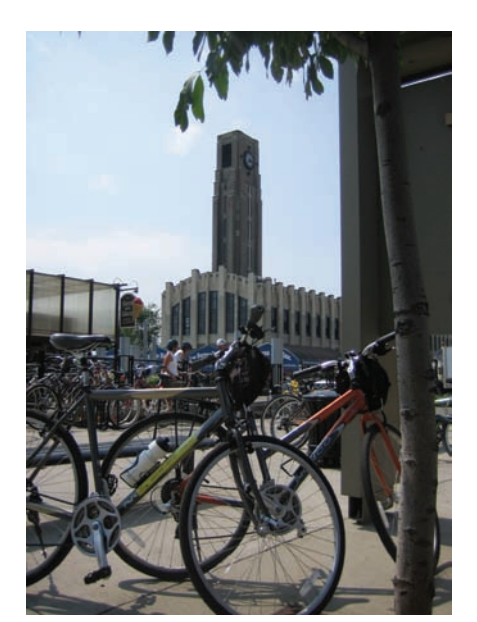
Lachine Canal Trail, Montreal, Canada links to the Atwater Market.

While these recent developments in Minneapolis show promise, a more fully developed approach to integrated TrOD has emerged just to our north in Montreal. The Lachine Canal Trail shows how city investments in public space improvements, coupled with tax